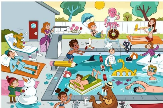
Silly Swim

Example: Loudly the walrus played the guitar beside the noisy swimming pool full of people.